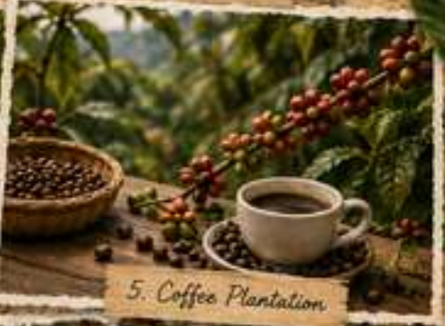
5. Coffee Plantation