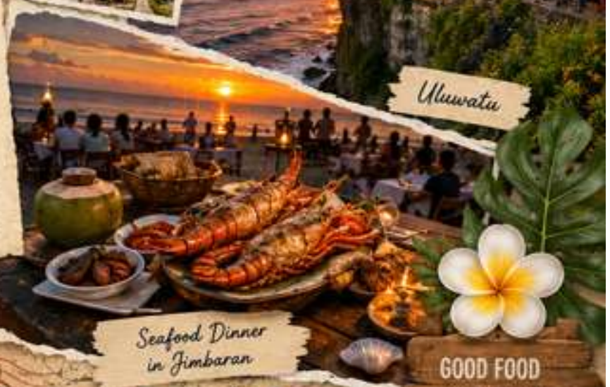
Seafood Dinner in Jimbaran