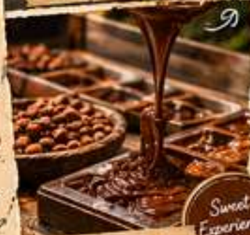
3. Chocolate Factory