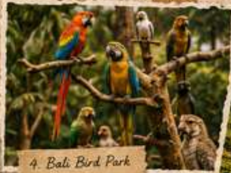
4. Bali Bird Park