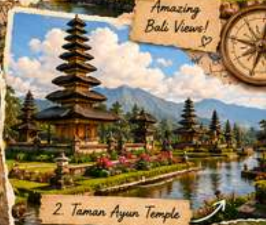
2. Taman Ayun Temple