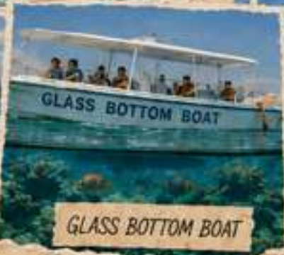
GLASS BOTTOM BOAT