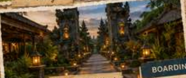
7. Drop Off Hotel