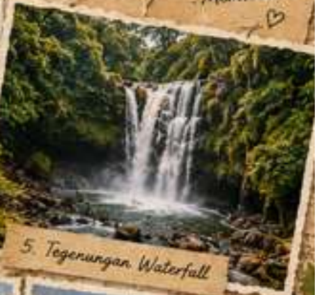
5. Tegenungan Waterfall