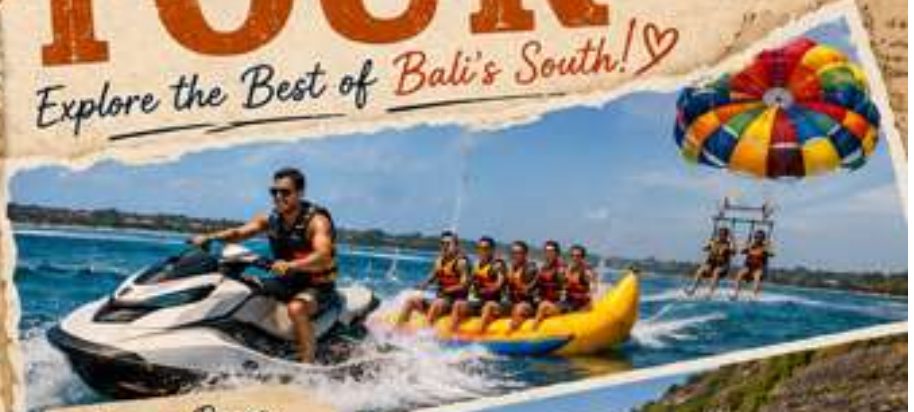
Tanjung Benoa Watersports

Enjoy delicious seafood dinner by the beach with a beautiful sunset.