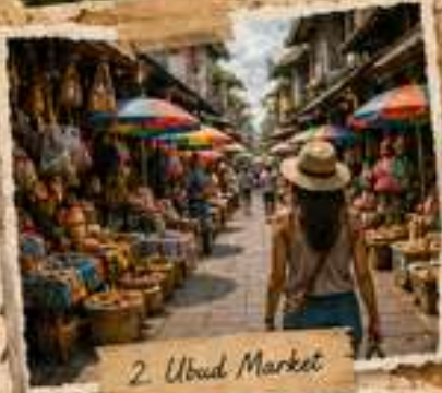
2. Ubud Market