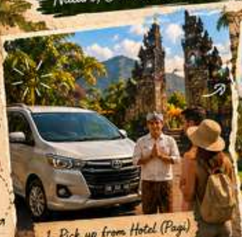
1. Pick up from Hotel (Pagi)

We'll take you back safely to your hotel.