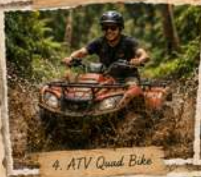
4. ATV Quad Bike