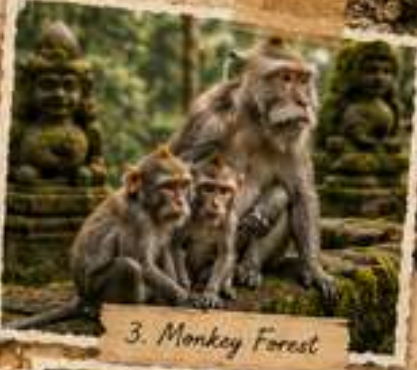
3. Monkey Forest