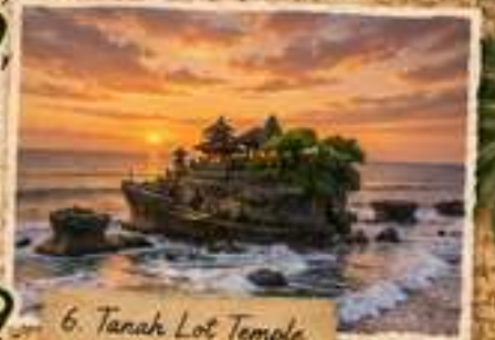
6. Tanah Lot Temple