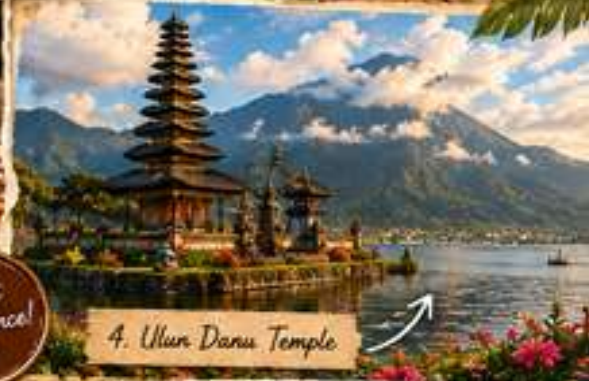
4. Ulun Danu Temple