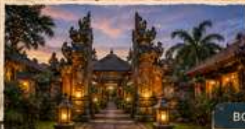
7. Drop off to hotel