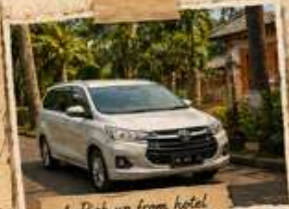
1. Pick up from hotel (Pagi)