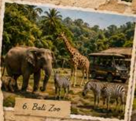
6. Bali Zoo