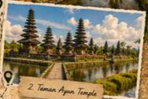
2. Taman Ayun Temple