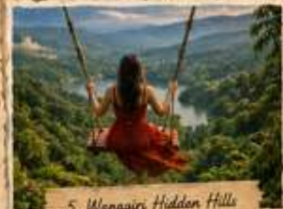
5. Wanagiri Hidden Hills