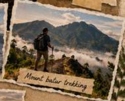
Mount batur trekking