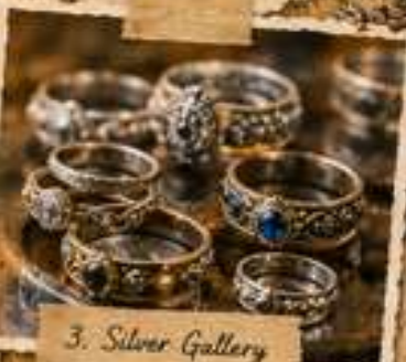
3. Silver Gallery