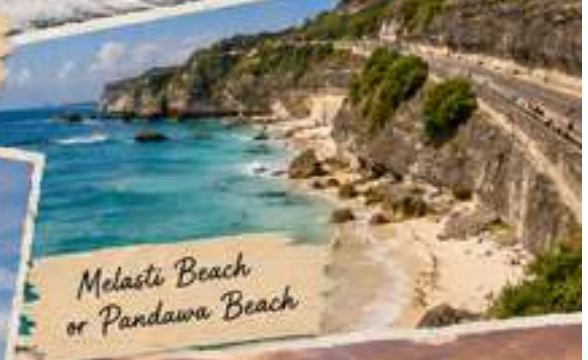
Melasti Beach or Pandawa Beach