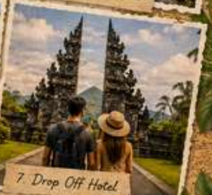
7. Drop Off Hotel