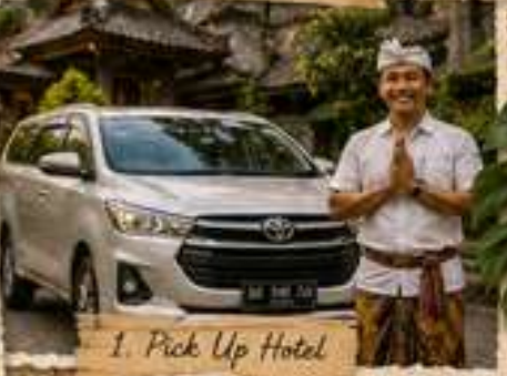
1. Pick Up Hotel