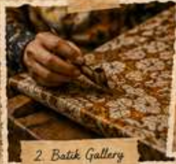
2. Batik Gallery