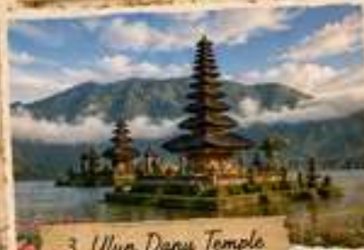
3. Ulun Danu Temple & Beratan Lake