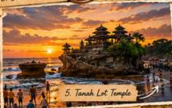
5. Tanah Lot Temple